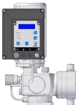
Controllable diaphragm pump, type C 409.2