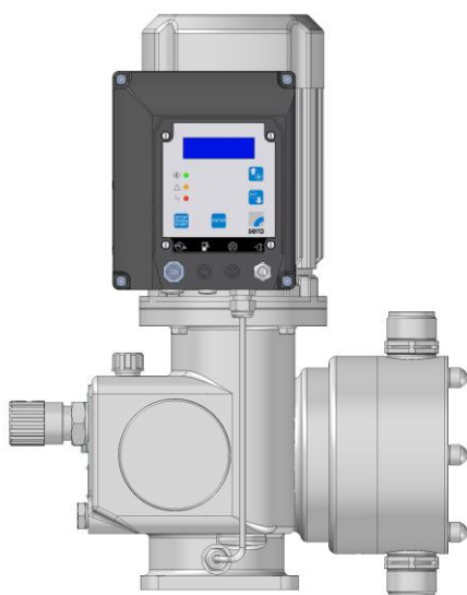
Controllable diaphragm pump, type C 410.2 (0,37 kW)