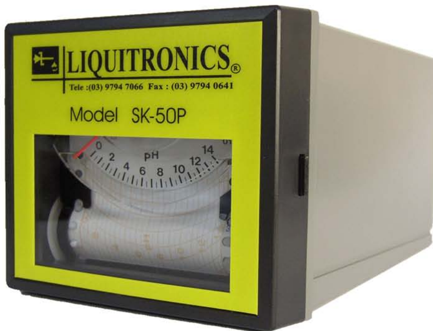
Chart Recorder SK-50P